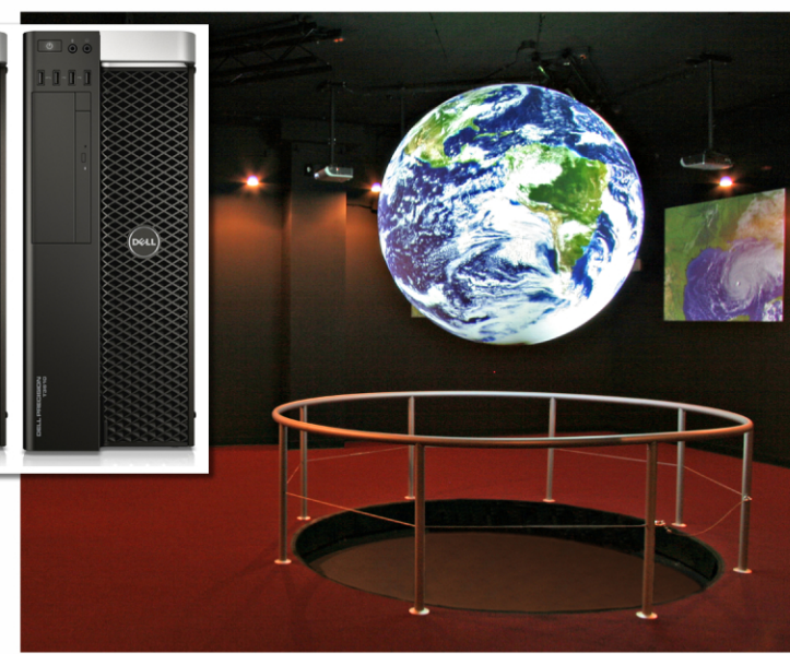
Science on a Sphere® in the David Himes Planet Theater®, Boulder, Colorado, USA