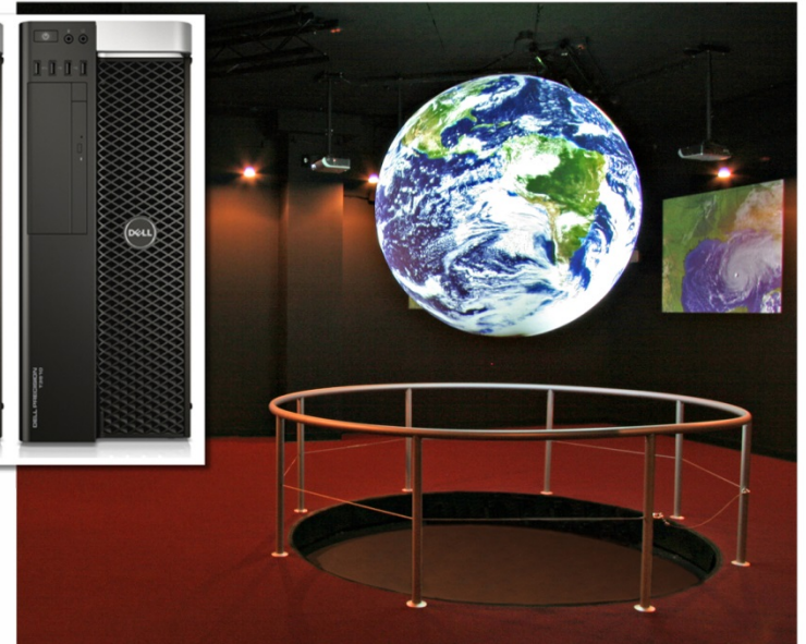
Science on a Sphere® in Planet Theater®, Boulder, Colorado